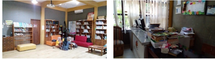
Figure 5. Library of SD Muhammadiyah Purwodiningratan

Figure 5 is the library at SD Muhammadiyah Purwodiningratan, showing the installed projector. The computer serves as a tool for the administration of book lending in the library. The projector itself is used when students get bored with classroom learning to re-energize them in following the lessons. The computer itself is used to record students when borrowing books to make it easier and prevent books from getting lost. Based on interviews, observations, and documentation, it can be seen that the facilities and infrastructure of SD Muhammadiyah Purwodiningratan are adequate and can support the implementation of learning by comfortably integrating technology.