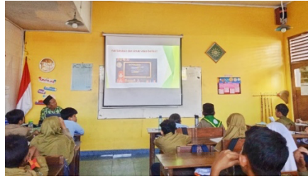
Figure 4. Islamic studies use PowerPoint and video media.

Figure 4 is an Al-Islam lesson using PowerPoint and video media on the topics of Qurban and Aqiqah . The teacher provided a brief explanation of the material, then showed a video through YouTube. The teacher created a PowerPoint using Microsoft PowerPoint as an aid and showed the students focusing on the lesson. The use of media in Al-Islam learning with the subject matter of Worship , specifically regarding Qurban and Aqiqah , is provided in the form of PowerPoint presentations, video screenings, and books. Thus, it can be concluded that the integration of technology in Al-Islam and Kemuhammadiyah education is through the use of media and teaching materials such as PowerPoint, educational videos, and books. Teachers also utilize Canva and YouTube and require a laptop and internet to create these media.