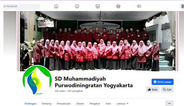
Figure 6.1 Utilization of social media

Figure 6 shows the social media used by SD Muhammadiyah Purwodiningratan. It can be concluded that the school has integrated technology through social media. The presence of school social media can create connections between the school, teachers, students, and parents. Social media also makes it easier for schools to provide important information related to the school and can broadly attract and entice the community to enroll their children in the school.