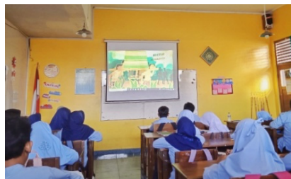
Figure 3. Muhammadiyah learning uses PowerPoint and video media.

The use of media was carried out using PowerPoint and educational videos. The results of the observational data analysis show that the teacher teaches Muhammadiyah education using PowerPoint and educational videos.